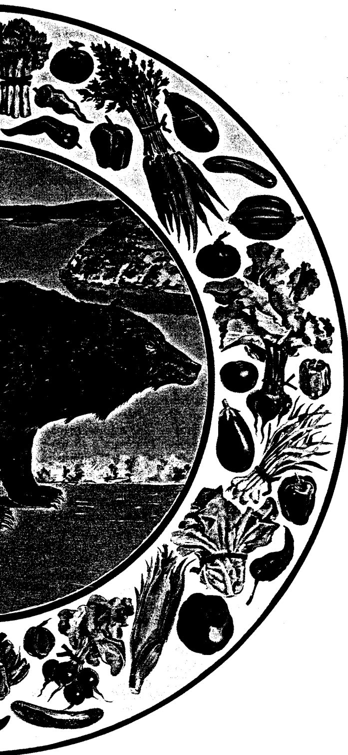
Don Nice, American Totem: Cornucopia Bear, 1981

In 1984, Frédéric Briand, an ecologist now at the International Union for Conservation of Nature, in Gland, Switzerland, and I devised a way of circumventing this problem, by redefining a species (usually thought of as a group of plants or animals with shared genetic traits) as a collection of creatures that behave alike within a food web. For example, if three species of grasshoppers all eat the same food and are, in turn, eaten by the same birds, they can be considered members of the same trophic spe-