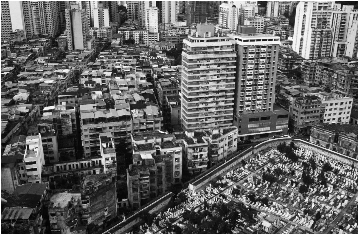
An aerial view of Macau, China.