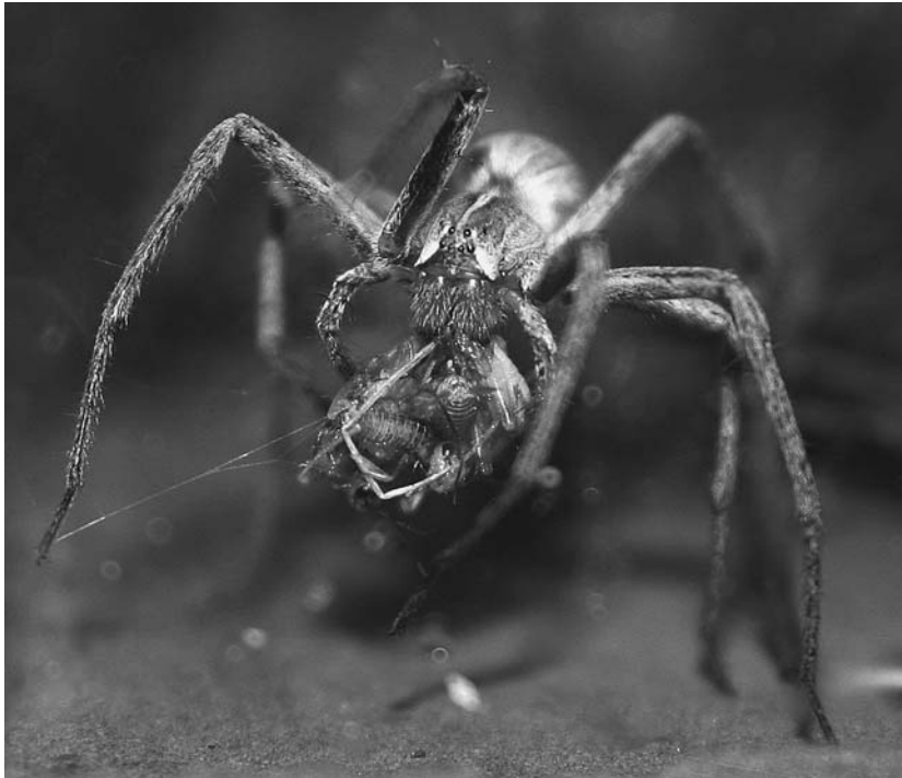
PLATE 1. Predator-prey interaction between the lycosid spider Pisaura mirabilis and the cricket Gryllus assimilis .